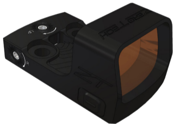
THDM21 MICRO REFLEX